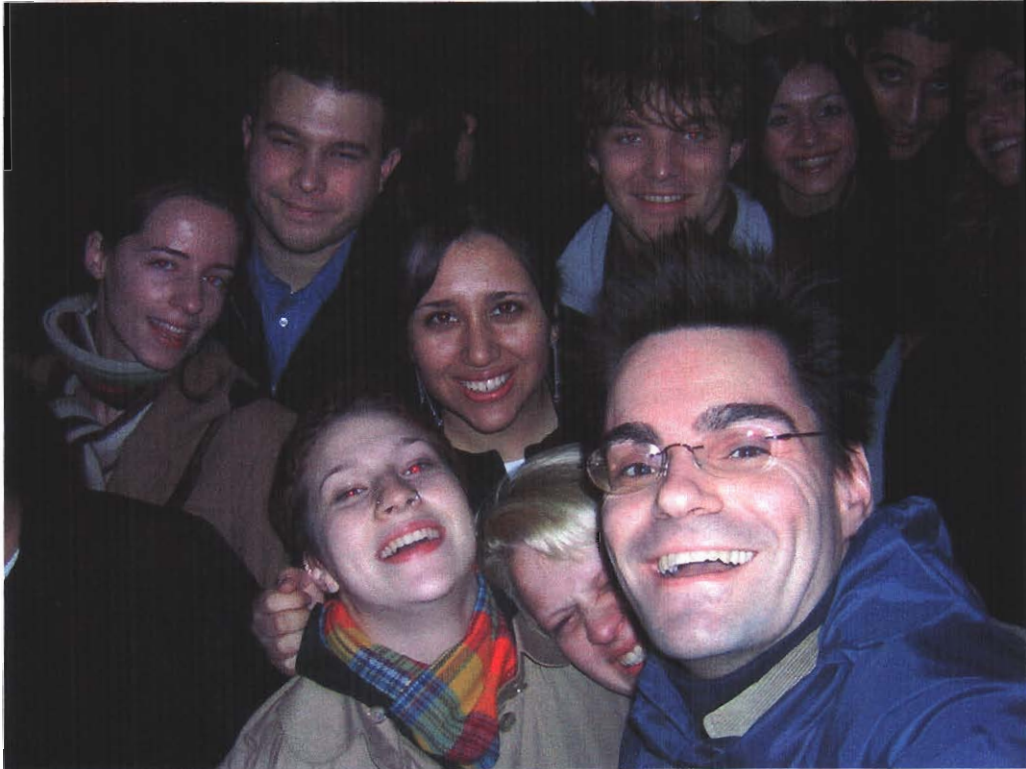
*Does anyone know those 3 in the back-right corner?