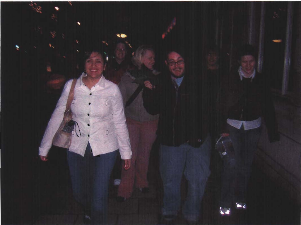
*A leaf and radiation shoes