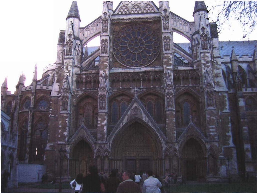
*The oldest thing I've ever laid eyes on