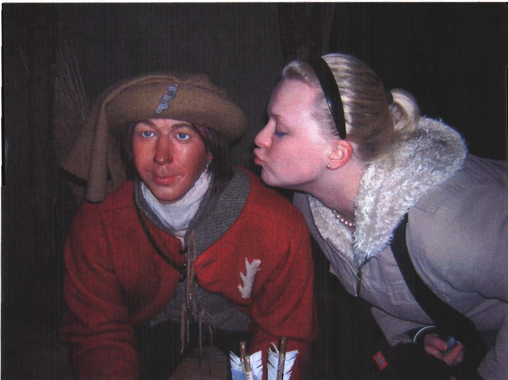
*This unsuspecting wax statue has no idea what he's in for