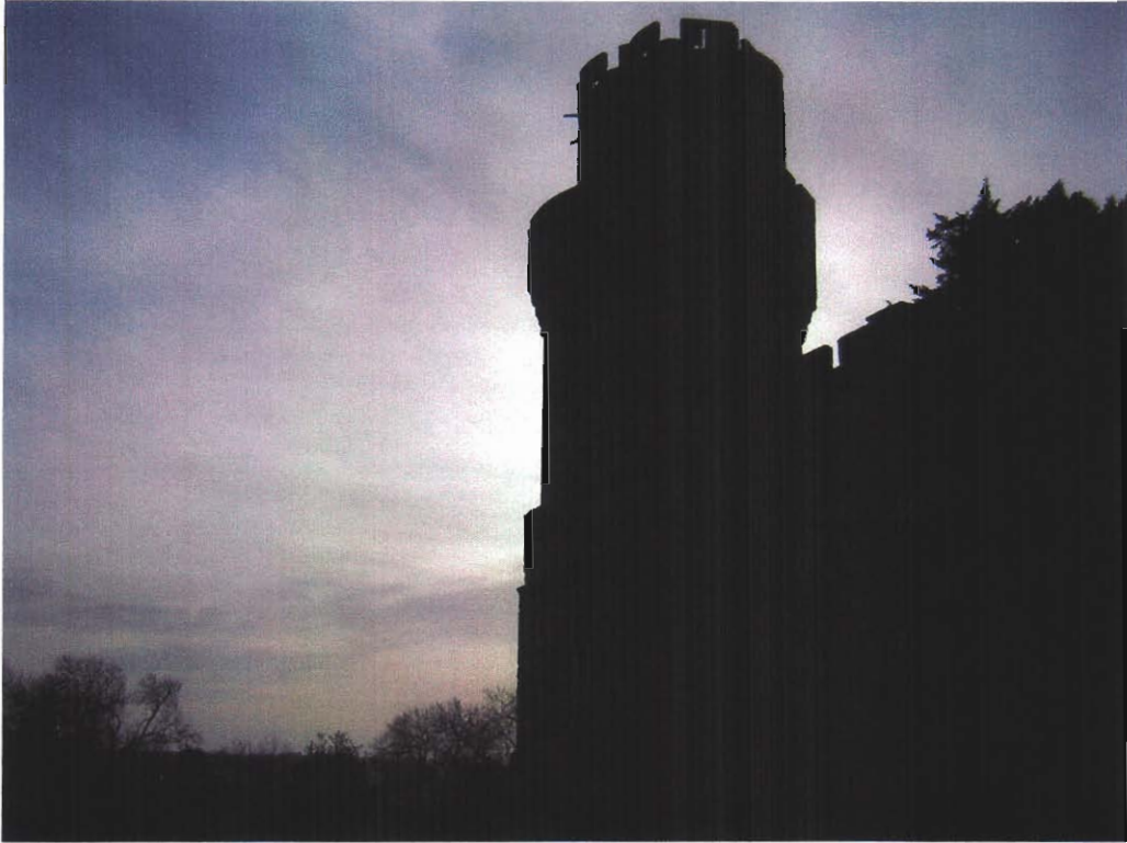
*The sun setting on Warwick Castle