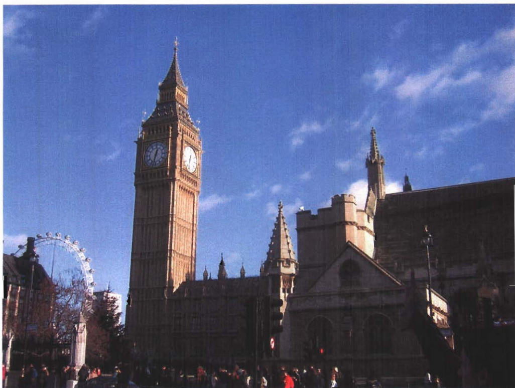
*Big Ben, not on New Year's Eve, minus 10 million Londoner's