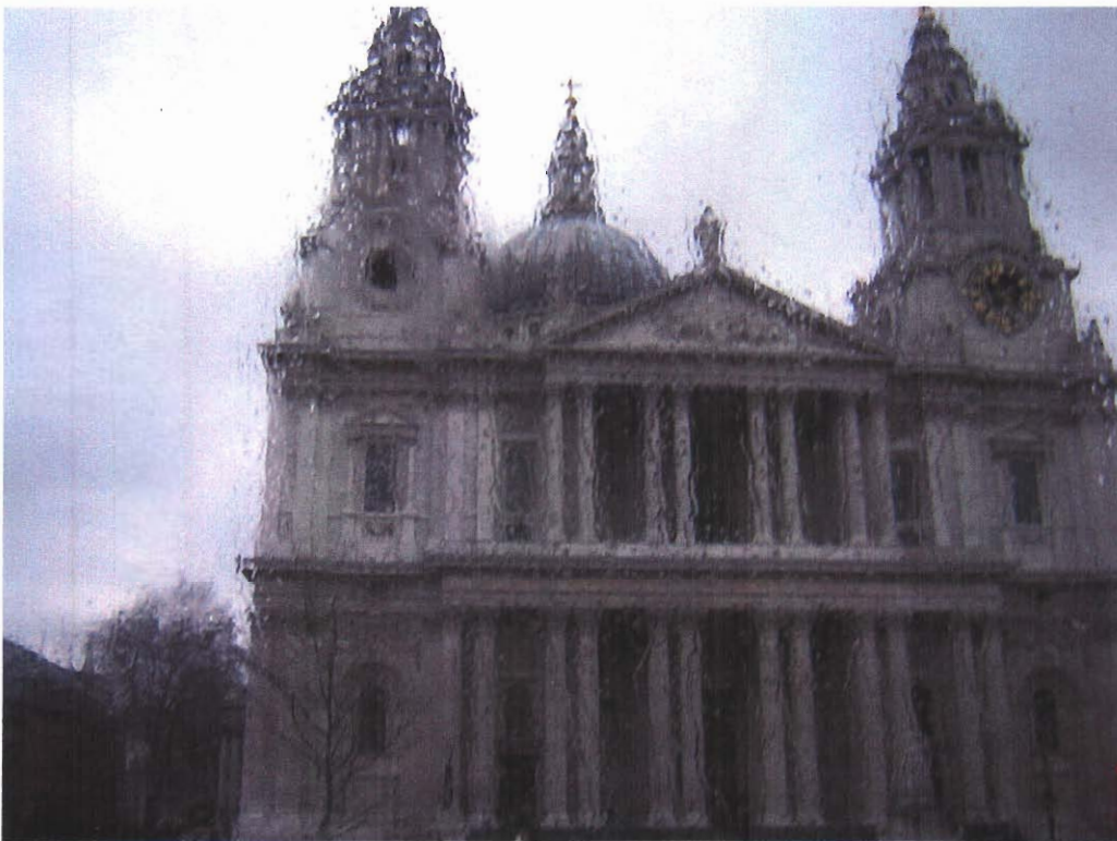
*This was so beautiful my tears just wouldn't stop flowing