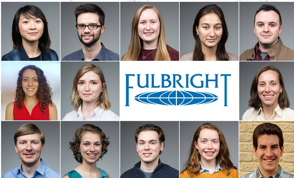
The 13 students & recent alumni who were offered 2019-20 grants.