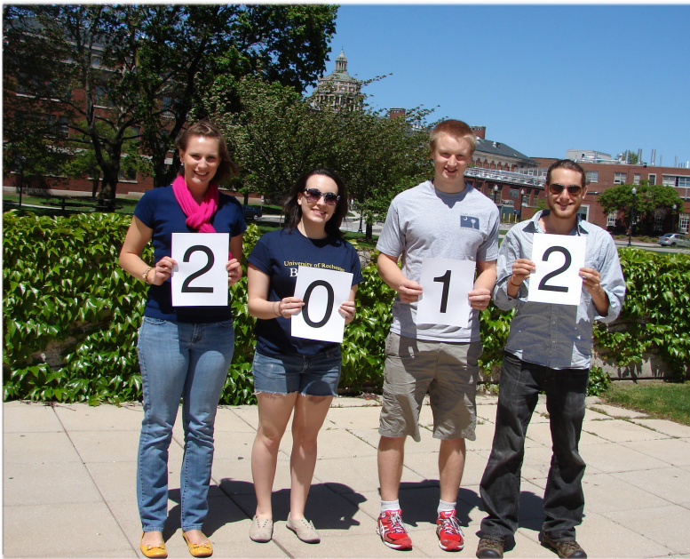
The Biology Department Congratulates the Class of 2012!