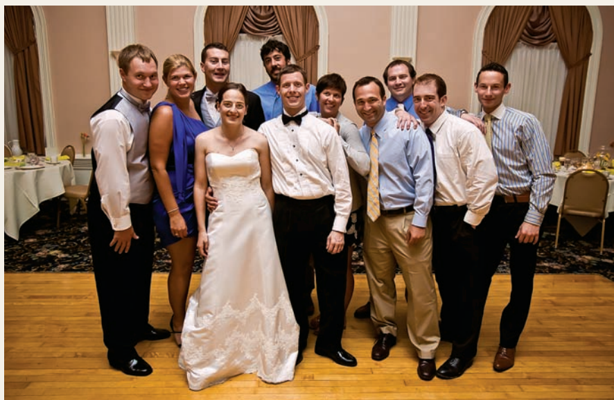
2004 Smith and King