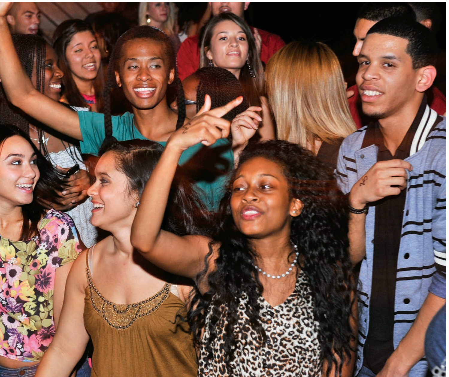
CELEBRATE! Partygoers at the 25th Annual Tropicana Dinner and Dance, sponsored by the Spanish and Latino Students' Association, celebrated into the wee hours.