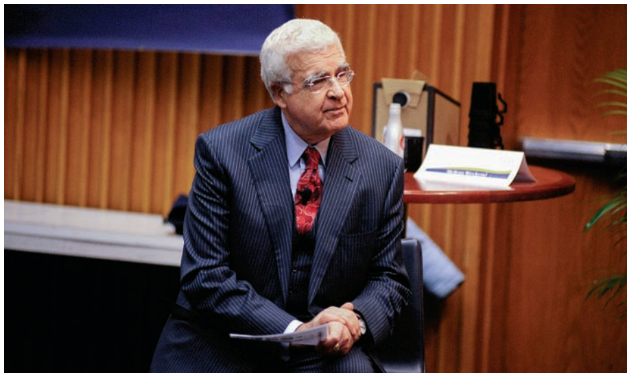
SPORTS COURT: Noted legal commentator and scholar Arthur Miller '56, '08 (Honorary) (left) focused his annual Miller's Court on intercollegiate athletics and the role of sports at colleges and universities.

Fans cheer on the Yellowjackets (above) during the homecoming football game. Leading early, Rochester lost 31-21 to Rensselaer Polytechnic Institute. Also at home, the field hockey team posted an 8-1 win over Morrisville State College.