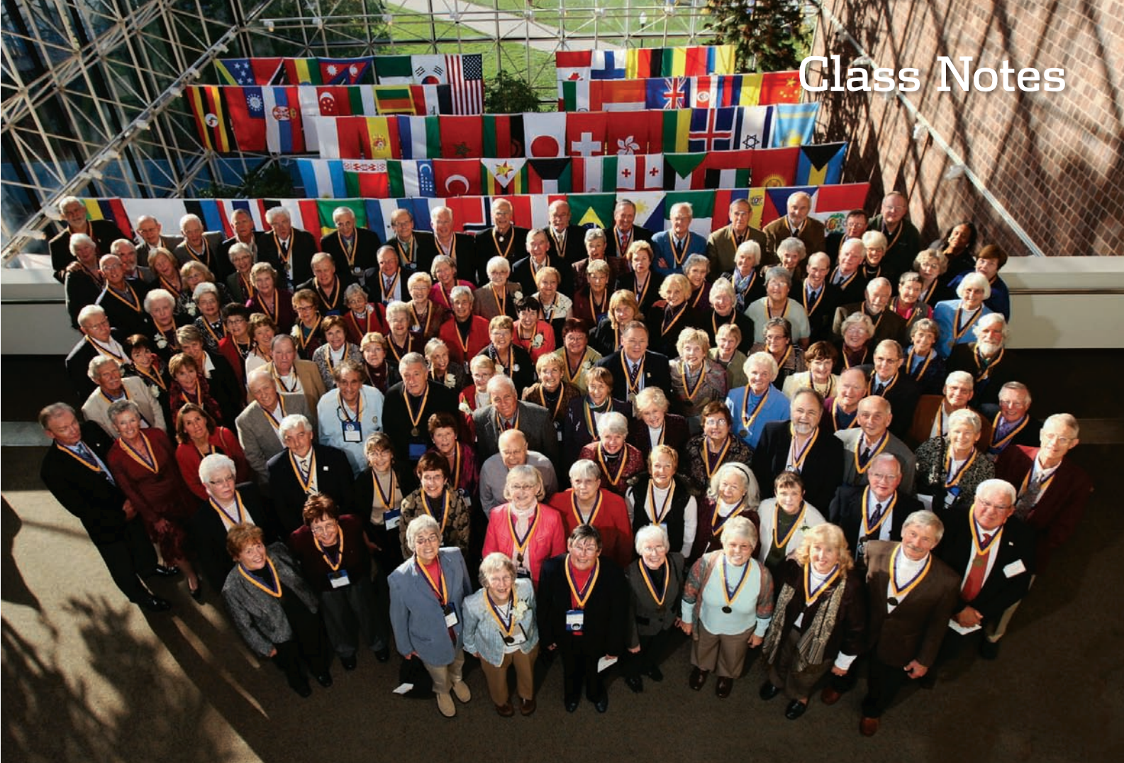
FACES OF THE 50TH: Members of the Class of 1962 from Arts, Sciences & Engineering and from the School of Nursing pause for a class photo to celebrate their 50th reunion during Meliora Weekend. Each member of the class received a medallion to mark the occasion as did 50th reunion classes at the Eastman School and the School of Medicine and Dentistry.