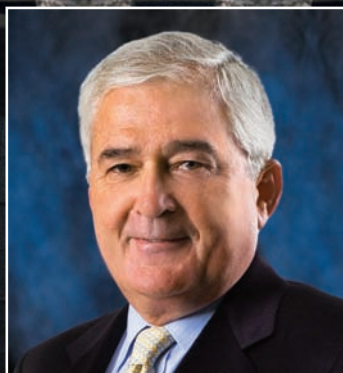
Lou Gerstner Former Chairman and CEO, IBM Executive of the Year Recipient