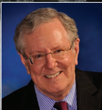
Steve Forbes Chairman and Editor-in-Chief, Forbes Media