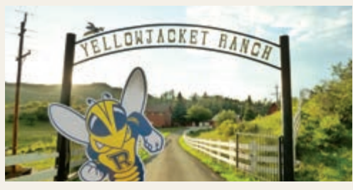
Rocky poses for Amanda Cronkhite '99 at Yellowjacket Ranch, on US-160W in Colorado.