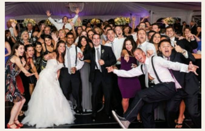
2003 Morganstein and Cama