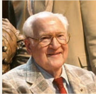
Ward won the Pulitzer Prize in 1962 for his opera, The Crucible .

What I gained from that first collaboration with Robert was first and foremost a great friendship that lasted until his death in April at age 95. His mentorship, advice, and interest in my personal well-being were special to me, but I know that this act of kindness, generosity, and sincerity was repeated countless times with young