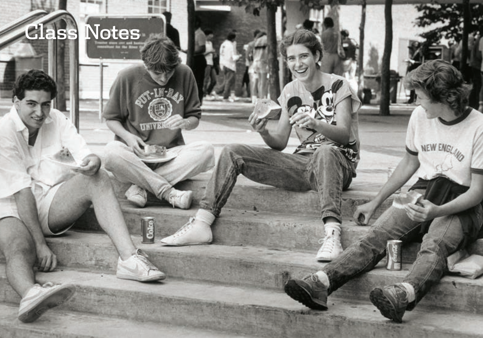
MELON FELLOWSHIP: Students enjoy summer refreshments during orientation activities, circa 1981. Recognize anyone? Write us at rochrev@rochester.edu .