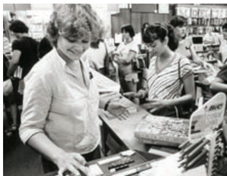
DATED: A photo is traced to the early 1980s.