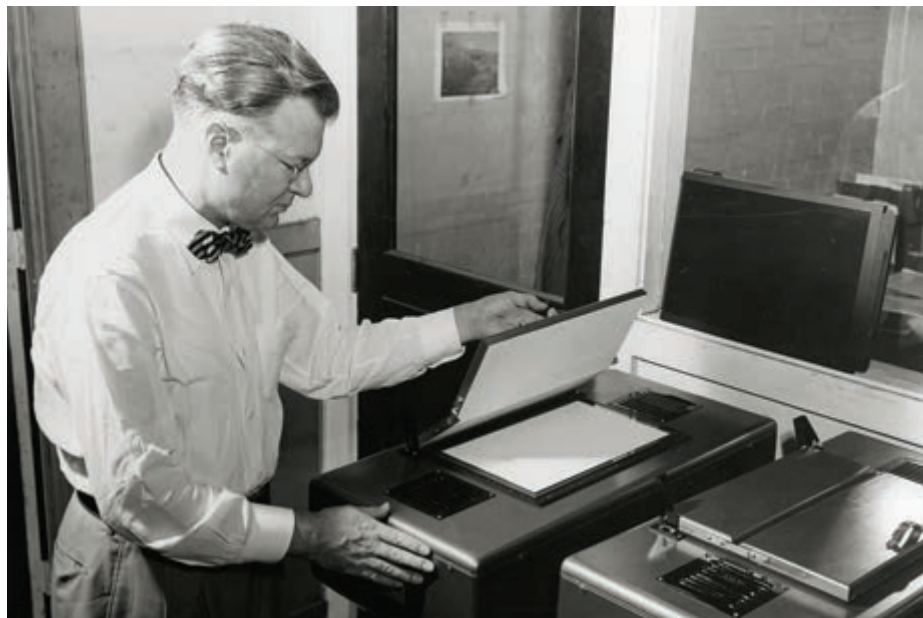
BIRTHDAY: This fall marked the 75th anniversary of the invention of electrophotography by Chester Carlson (above), a process that Joseph Wilson '31 developed into the Xerox Corp.