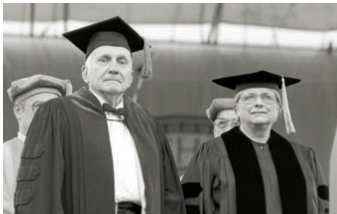
DRS. MASTERS & JOHNSON: William Masters '43M (MD) and Virginia Johnson received honorary degrees from Rochester in 1987.

played by Michael Sheen, and his research partner and later wife, Virginia Johnson, played by Lizzy Caplan, entered the popular