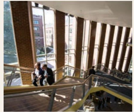
NEW FACILITY: One of several new buildings supported by the Campaign, Rettner Hall opened in 2013.

For more information about The Meliora Challenge , visit campaign.rochester.edu .