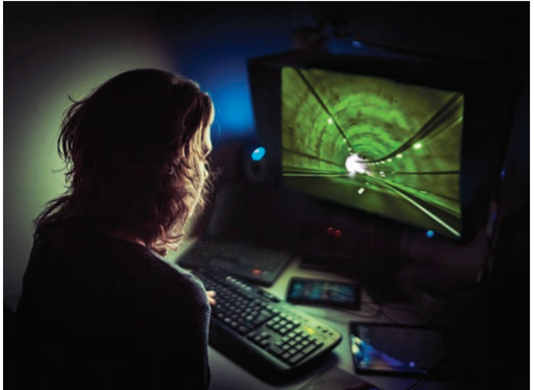
GAME PLAY: Video games induce hostility through frustration, not violent content, a new study says.