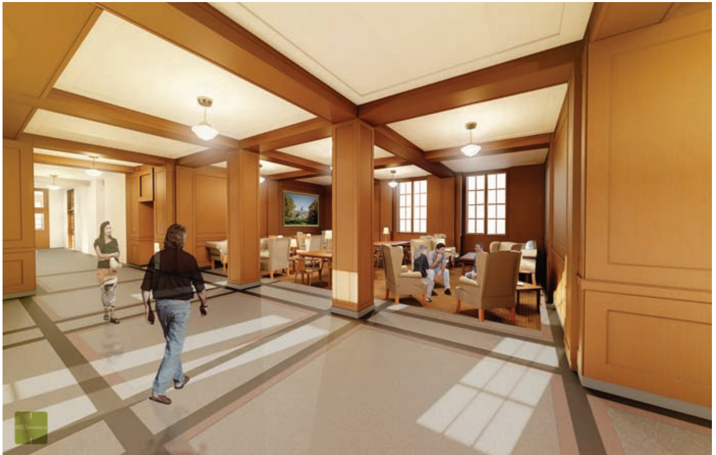
MOREY MARVEL: An architect's conceptual rendering shows plans for some of the spaces in a multifloor renovation of Morey Hall.