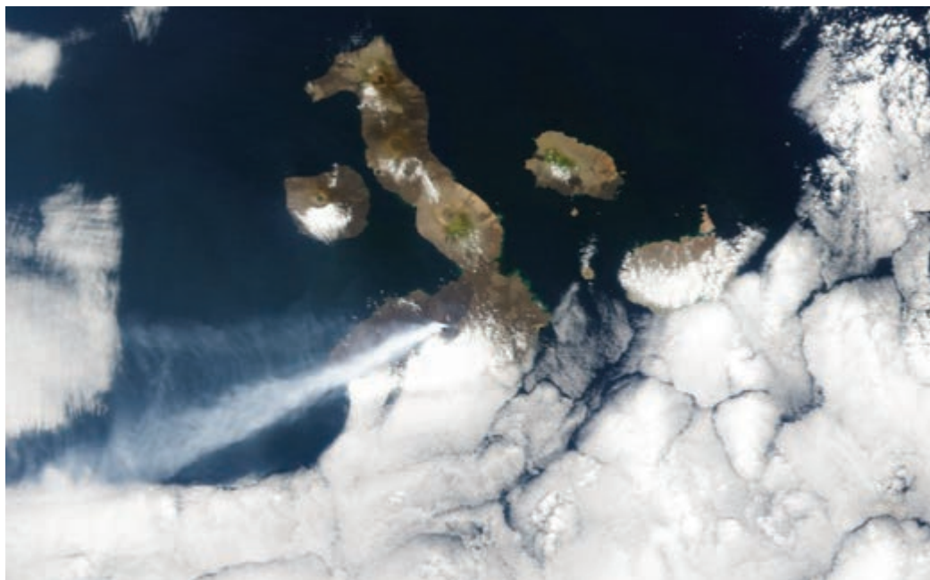
VOLCANIC PLUME: A satellite image captures steam and ash rising from the Sierra Negra volcano.