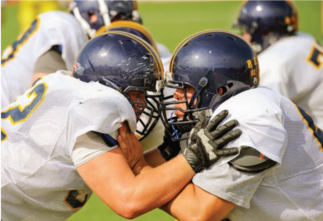
HEADWAY: Yellowjacket football players took part in a Medical Center study indicating that the effects of head blows sustained over the course of a season can last more than six months.