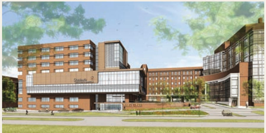
NEW LANDMARKS: A proposed home for an Institute for Data Science (above) and the new Golisano Children's Hospital are key projects in the University's strategic plan.