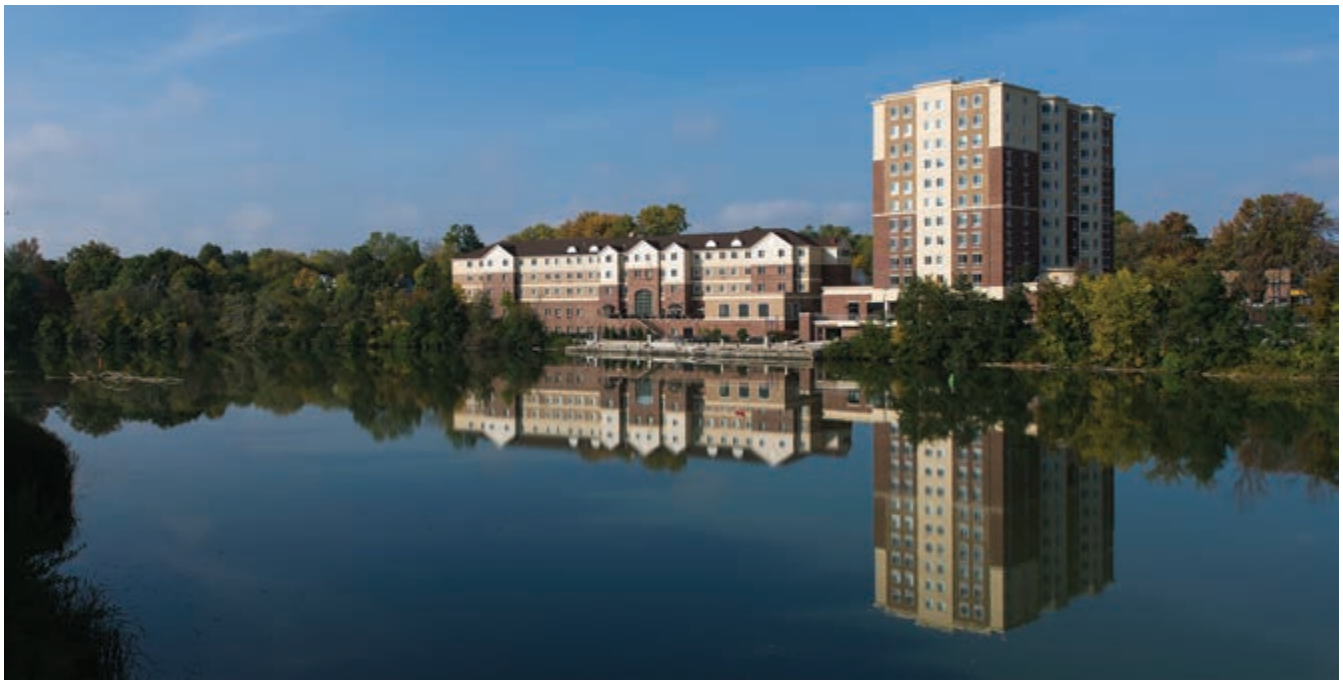
RIVER VIEWS: The Brooks Crossing Apartments (at right) houses about 170 students.