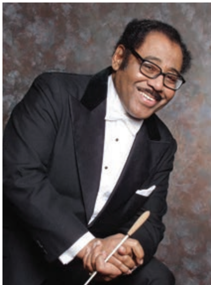
MAESTRO: Freeman founded the Chicago Sinfonietta, a world-class orchestra noted for its racial and gender diversity.

Maestro brought us on many tours all over Western Europe and the United States; we played in some of the finest concert halls in the world. He also championed new music and young talent. Our soloists came from all over the world and included names such as Sharon Isbin and Chick