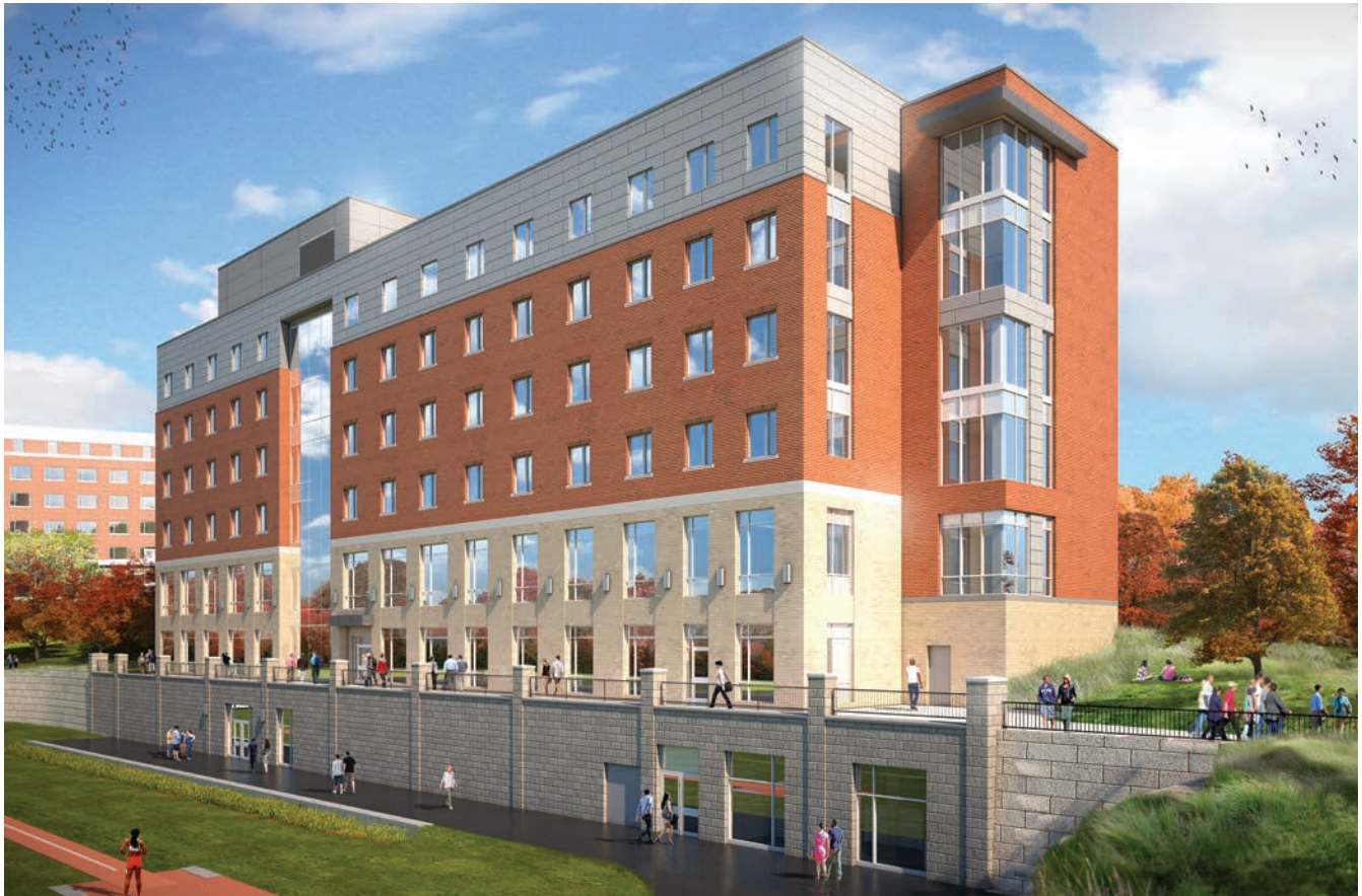
FIELD HOUSE: The Fauver field level of the new Genesee Hall will be home to the Boehning Varsity House, featuring facilities for athletics teams.