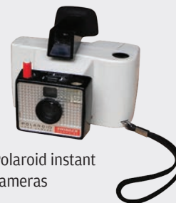
Polaroid instant cameras