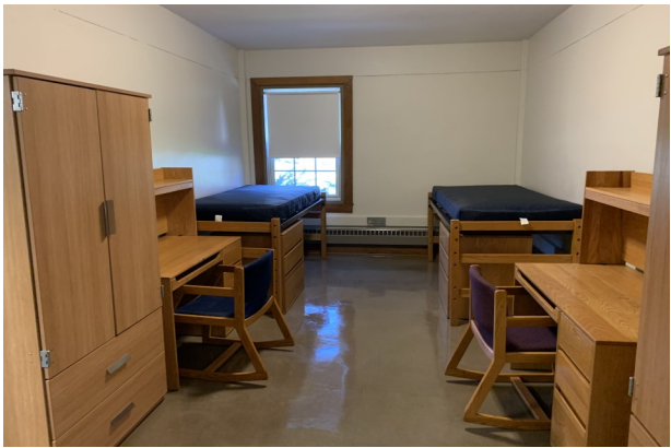
Burton/Crosby Hall double

There is one kitchen on each floor in Burton and Crosby. Group 2 meal plan.