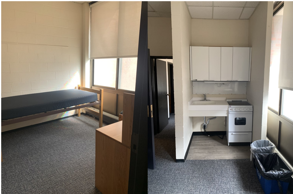
Hill Court 1-person apartment bedroom and kitchen

There are six 1 person apartments located on the first floor—2 in Chambers, 2 in Gale and 2 in Munro. They include a bedroom, living room and bathroom. These apartments cost a little more.