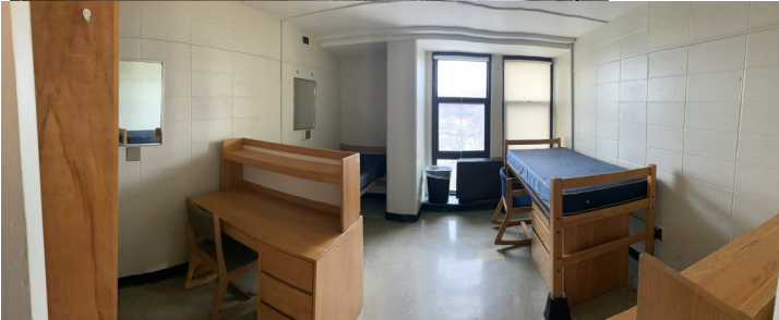
Jackson Court Center Double

O'Brien Typical Single = ~9' x 13' O'Brien Typical Double = ~11' x 21'