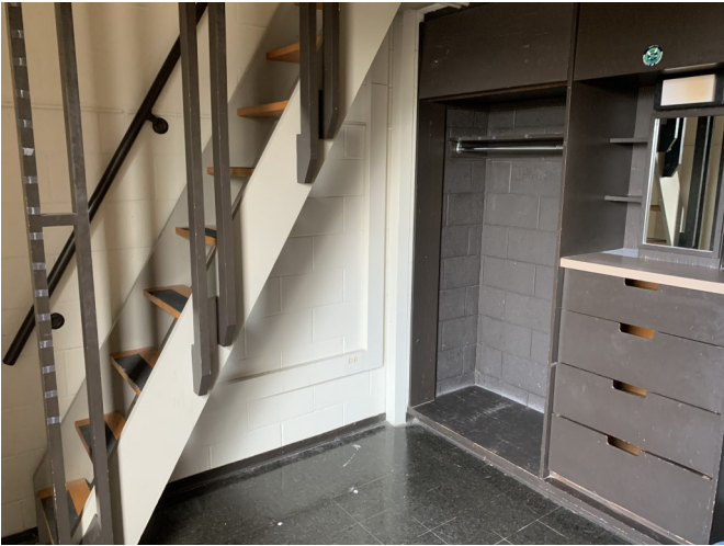
Hill Court Lofted Room

The bathroom is shared by all six (or 4 in the case of a 4 person suite ) residents and is cleaned once a week by the ESW.