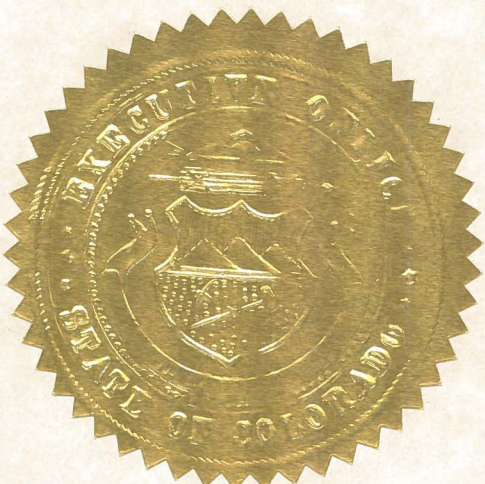
Jared Polis Governor

GIVEN under my hand and the Executive Seal of the State of Colorado, this third day of May, 2022