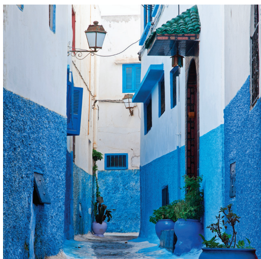
Rabat's Kasbah des Oudaias

Day 14: Depart for U.S. After breakfast this morning we transfer to the airport for our return flight to the U.S. B