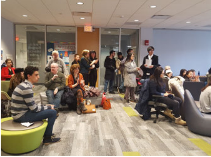
Above: Language Center Living Room 3rd Floor of Douglass Commons

“Without language, one cannot talk to people and understand them; one cannot share their hopes and aspirations, grasp their history, appreciate their poetry, or savor their songs.”