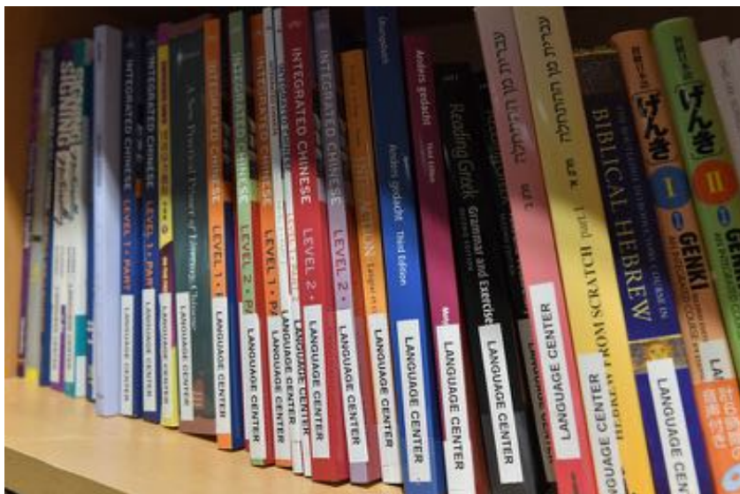
Daiki Nishioka, '21

Or, maybe you are like me and like to learn different languages just for fun or want to retain a language you learned in the past. The textbooks are great for that! I have learned Mandarin Chinese in the past but because of scheduling conflicts, I haven't been able to take a class. But I sometimes take the textbook and test myself how much I still remember and find out what I have forgotten or learn something new. I've also been interested in learning another language so I often take a look at textbooks for French, German and Korean and trying to figure out what I should learn next! Whatever it is that you need, the textbooks are always there for you!