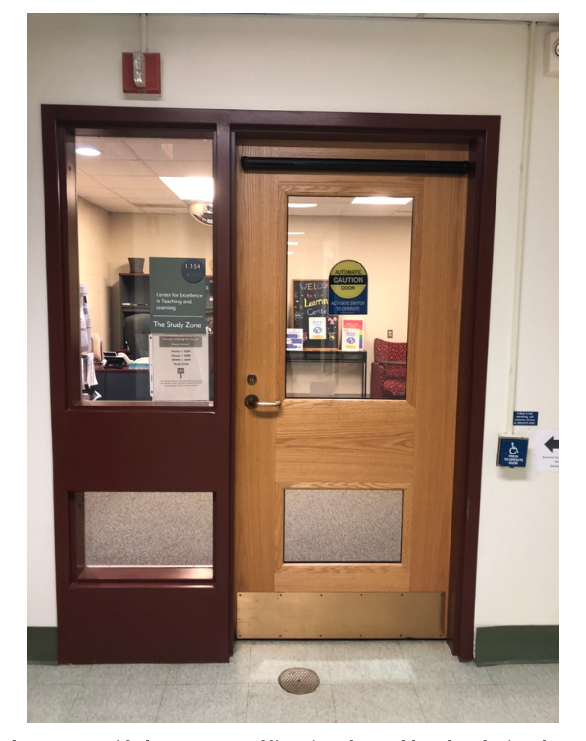
What to Do if the Front Office is Closed/Nobody is There

If you are coming to the Learning Center after our operating hours (8am – 5pm, Monday through Friday), the front office will be closed. However, you can still access the Learning Center suite by using the side entrance.