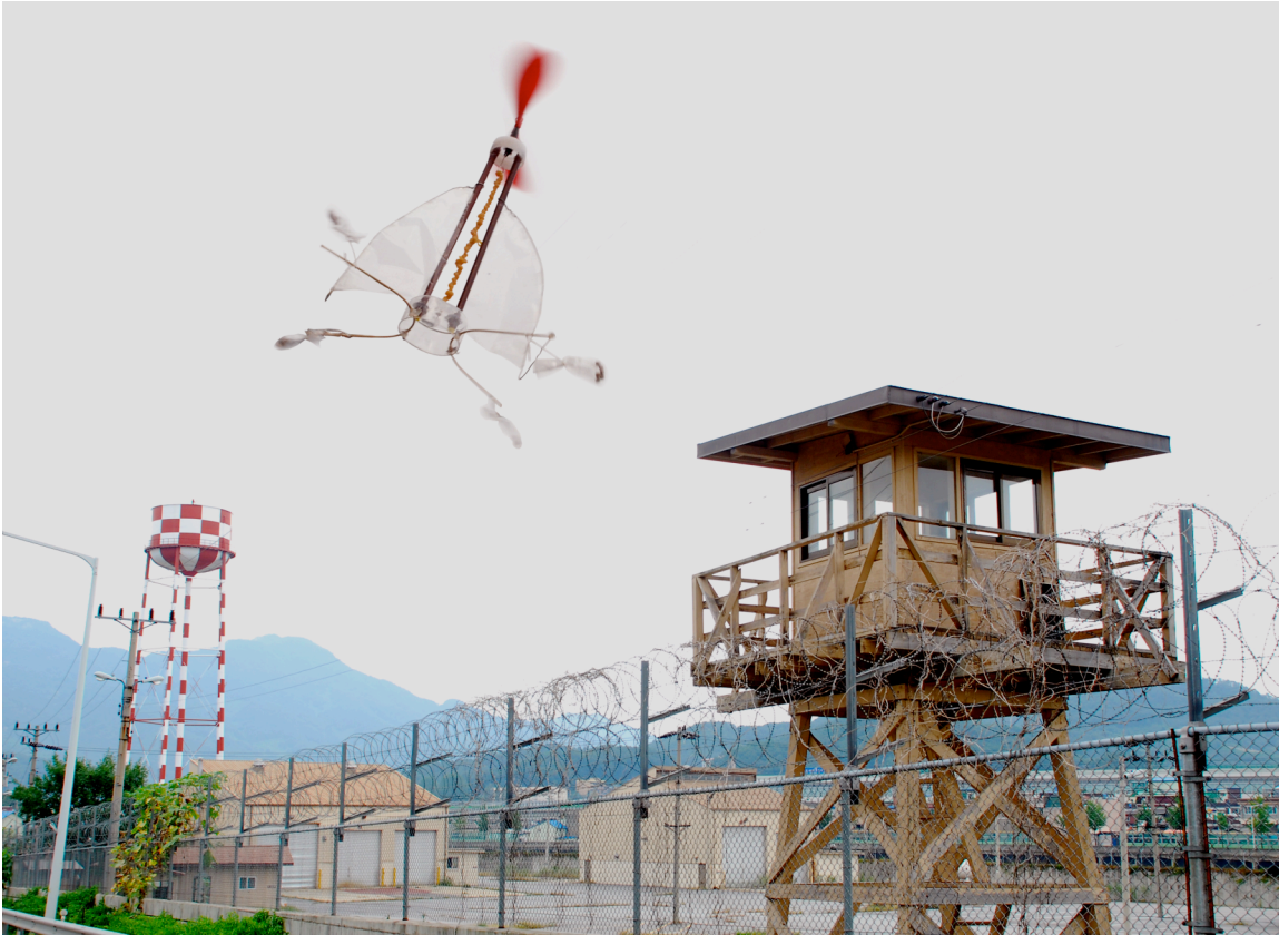
Figure 6. Sangdon Kim, Discoplan , 2007. Courtesy of the artist.

participating peasant-artists explicitly tries to make a profit from their “assets” (i.e. technical skills and materials like scrap metal). Various desires, and above all the desire to fly, a symbol of wanting a world alternative to the current one, are projected onto the objects on display.