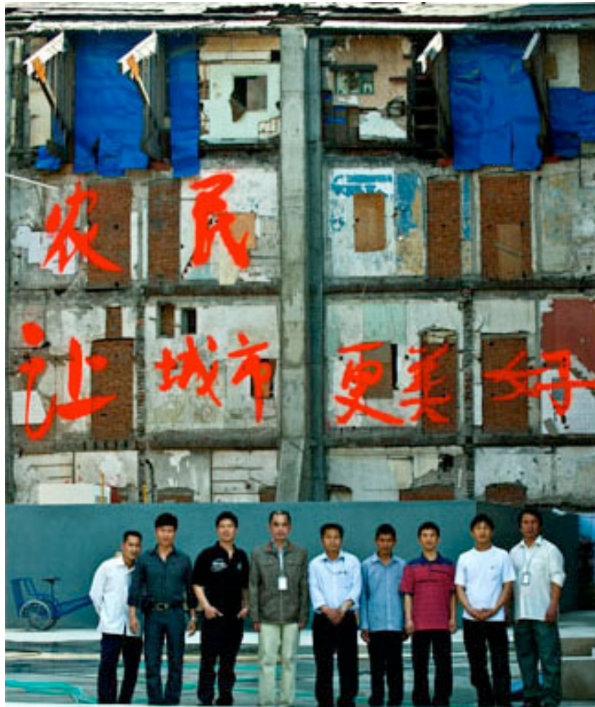
Figure 3. Inventors in front of Peasants—Making a Better City, a Better Life , Shanghai, 2010.

disenchanted, continuous time”). 8 The viewers entering into the RAM complex are welcomed by slogans painted in red Chinese calligraphic style, reminiscent of propaganda banners that until recently decorated factory walls and farming areas across China. Among them is: “Peasants—Making a Better City, a Better Life” ( nongmin rang chengshi geng meihao ), a spin on the Shanghai Expo’s slogan of “Better City, Better Life” ( chengshi, rang shenghua geng meihao ).