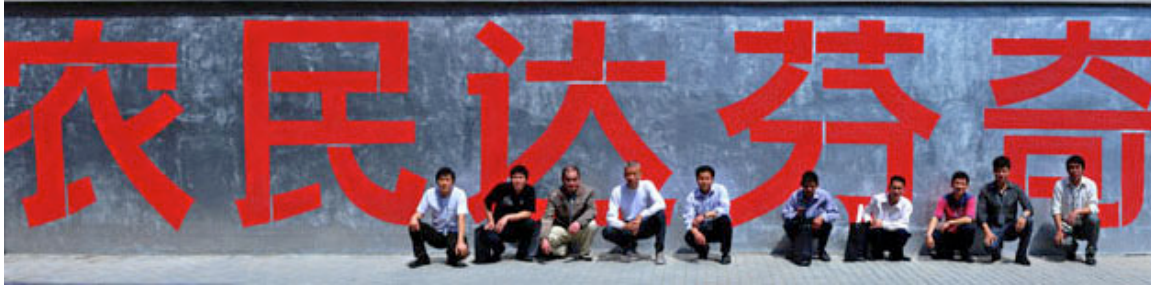
Figure 1. The inventors of Cai Guo-Qiang: Peasant Da Vincis , Rockbund Art Museum, Shanghai, 2010.