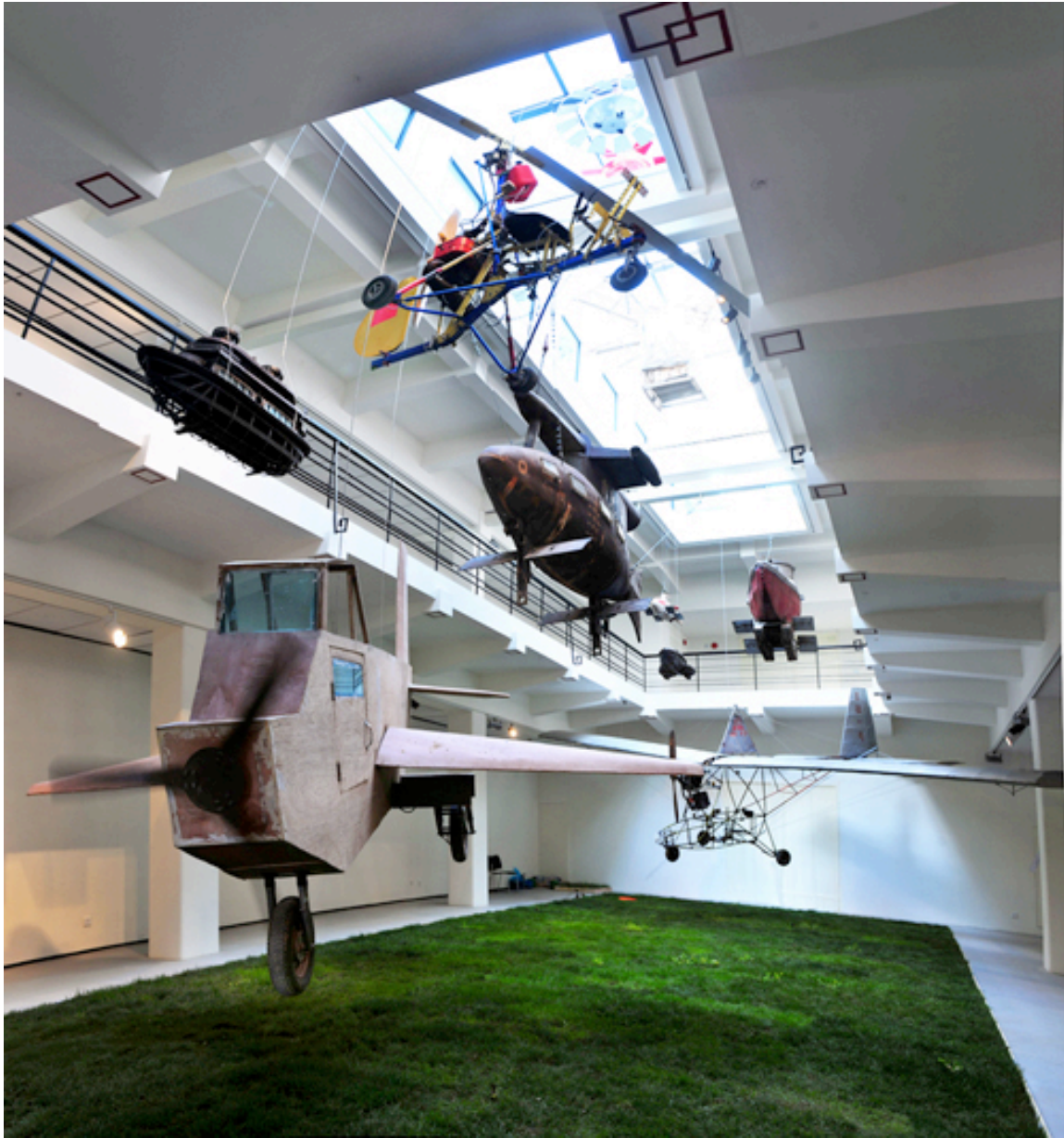
Figure 2. Cai Guo-Qiang, installation view of Fairytale , Shanghai, 2010.

Cai's exhibition pays affective homage to the Chinese subalterns transported from the more recent, socialist past of the People's Republic of China, and in so doing disrupts the strong sense of linear temporality that the city has imposed on a spatial scale.