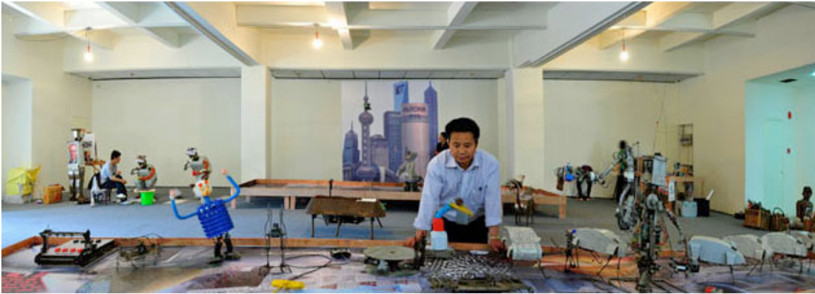
Figure 4. Cai Guo-Qiang, installation view of Wu Yulu's Robot Factory , Shanghai, 2010.

How can peasants be seen as part of the Expo-generated spectacle of modernization, except through a merely rhetorical repetition of peasants as the true owners of the Republic or through peasants-turned-migrant workers from provincial towns mobilized as manual labor in the construction of the Expo's world village, or its service industry?