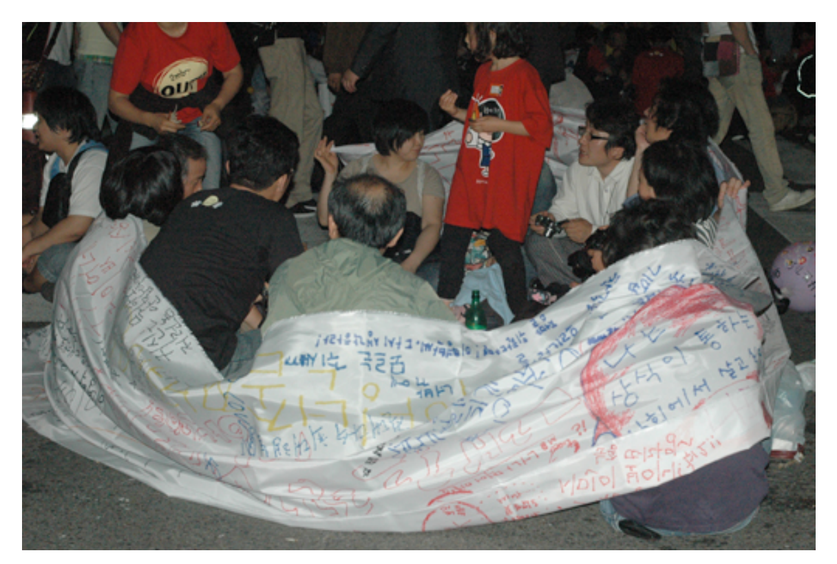
Figure 7. Gathering of Family and Friends.