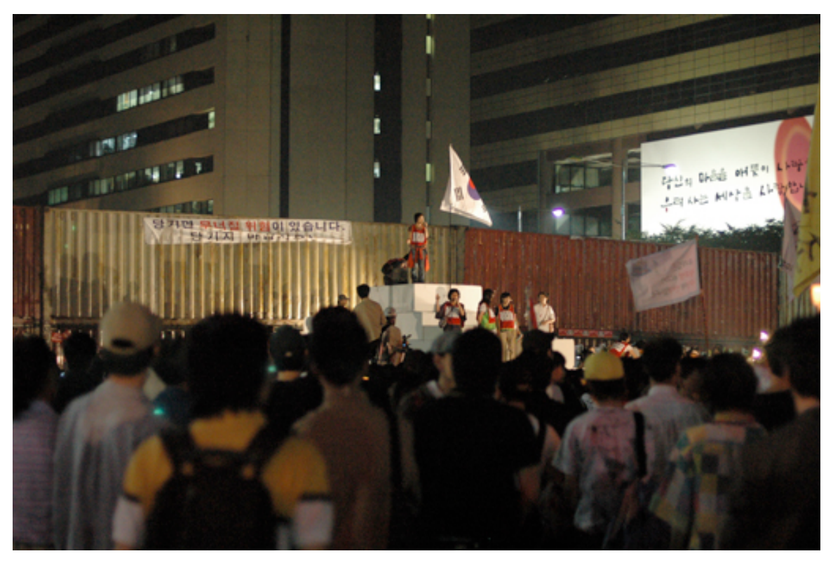
Figure 8. The Citizen's Fortress.