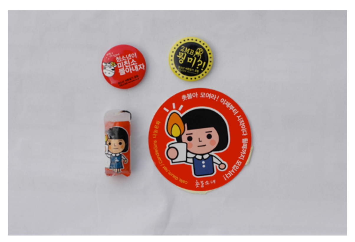
Figure 6. The Candlelight Girl.

It is precisely the protesters' "playfulness," as manifested in their civil discourse, that enabled the people to conceive of its political engagement as "pure," in diametrical opposition to the