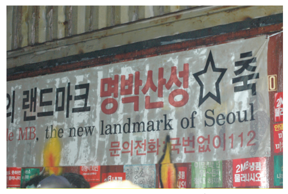
Figure 5. Myung-bak Fortress, June 10th, 2008.

hypostatization of the president's will not to communicate with the people.<sup>40</sup> In response to government's use of shipping containers—ironically symbols of trade and communication—to figuratively block dialogue, the protesters re-appropriated the barricade as a stage for criticizing and mocking the government with humor and satire.