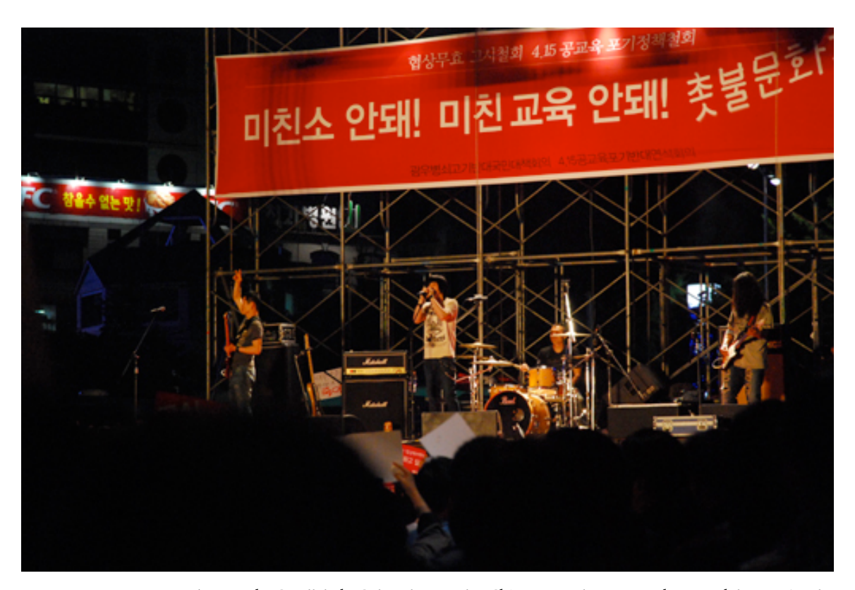
Figure 2. The Candlelight Cultural Festival at Ch'eonggye Plaza, 2008.