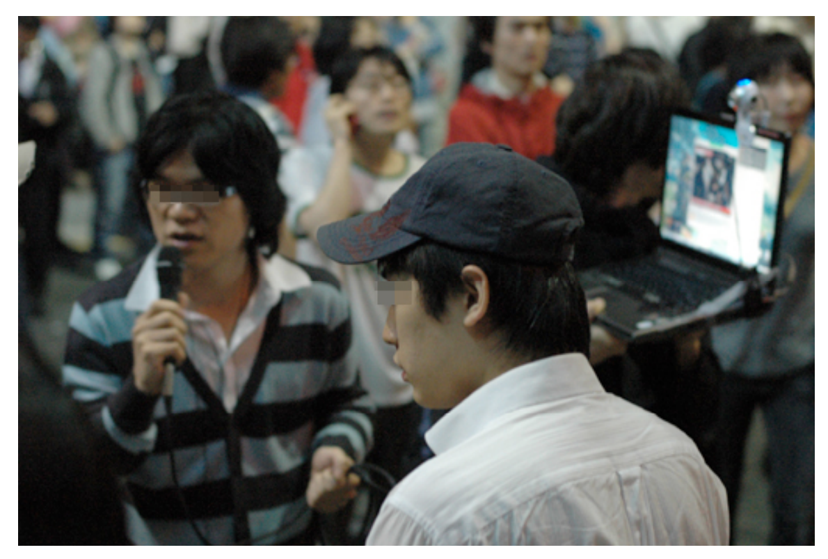
{\it Figure~3.}~ One-Person~ Reporters.~ Photograph~ by~ Kim~ Yunki.