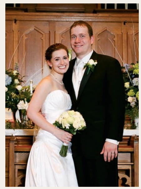
2007 Champion and Grantier