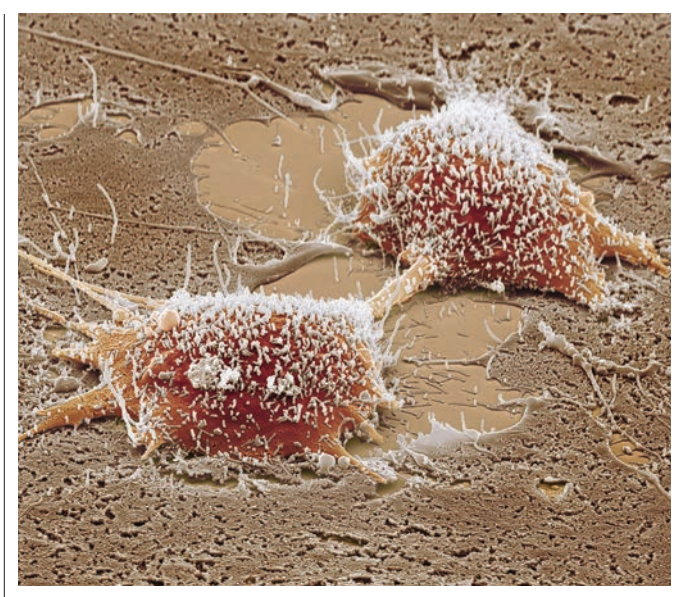
GLUTAMINE GLUTTONS: Cancer cells devour glutamine in order to replicate. They do it by fermenting sugar, according to a new study.