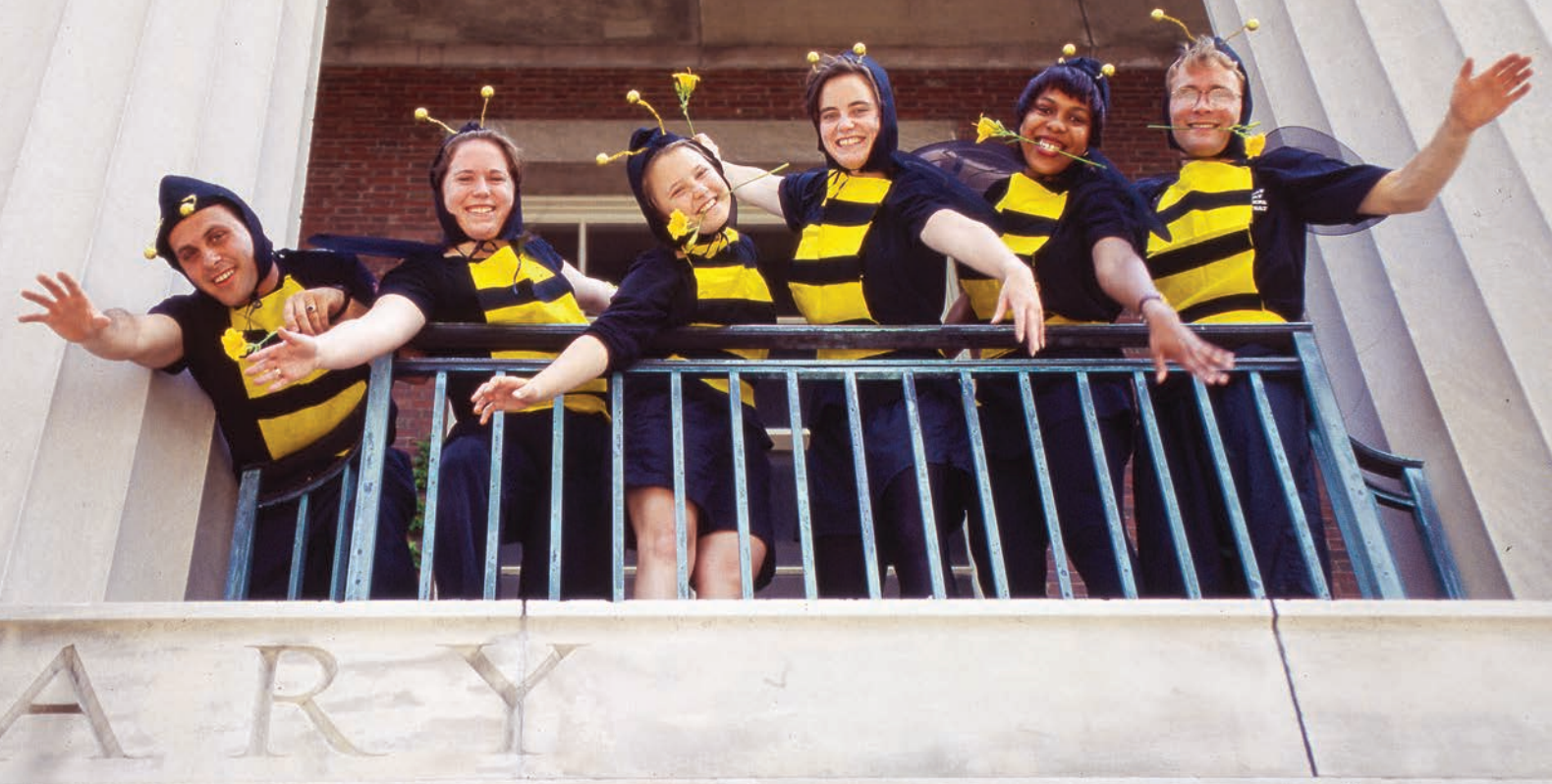
BUSY BALCONY: The Yellowjacket mascot Rocky, who turns 10 this year, has a few ancestors, such as these, pictured on the balcony of Rush Rhees Library. Recognize anyone? Email us at rochrev@rochester.edu .