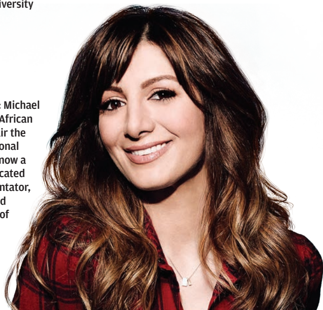
MUSIC & LAUGHTER: The genre-hopping musical ensemble Pink Martini (above), whose repertoire crosses jazz, classical, and pop music, will headline the annual Eastman Presents concert, and Saturday Night Live alumna Nasim Pedrad (below) will present an interactive comedy show during the weekend.