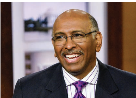
MEDIA MOVERS: Michael Steele, the first African American to chair the Republican National Committee and now a nationally syndicated political commentator, will be a featured speaker as part of the weekend's events.