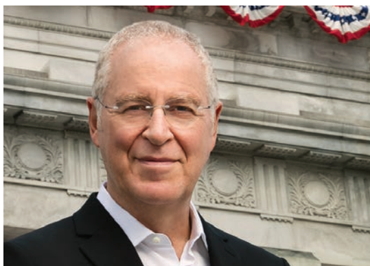
HISTORIC FIGURES: Author Ron Chernow, whose work has included biographies of Ulysses S. Grant, George Washington, Alexander Hamilton, and other pivotal American figures and families, will be the guest for this fall's University Symposium.