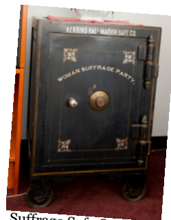
Suffrage Safe Opening