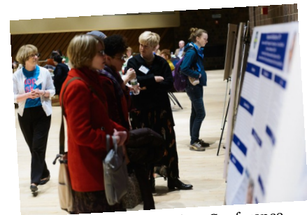
Survivor to Thrive Conference