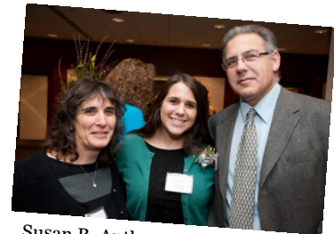
Susan B. Anthony Legacy Dinner