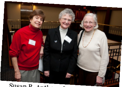
Susan B. Anthony Legacy Dinner