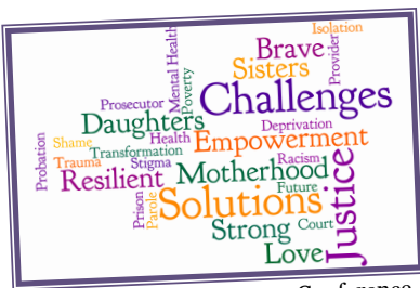
Justice Involved Women Conference