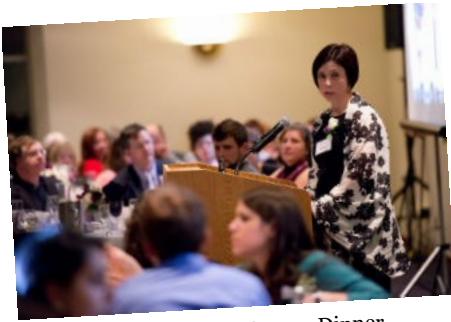
Susan B. Anthony Legacy Dinner