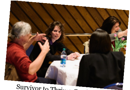
Survivor to Thrive Conference